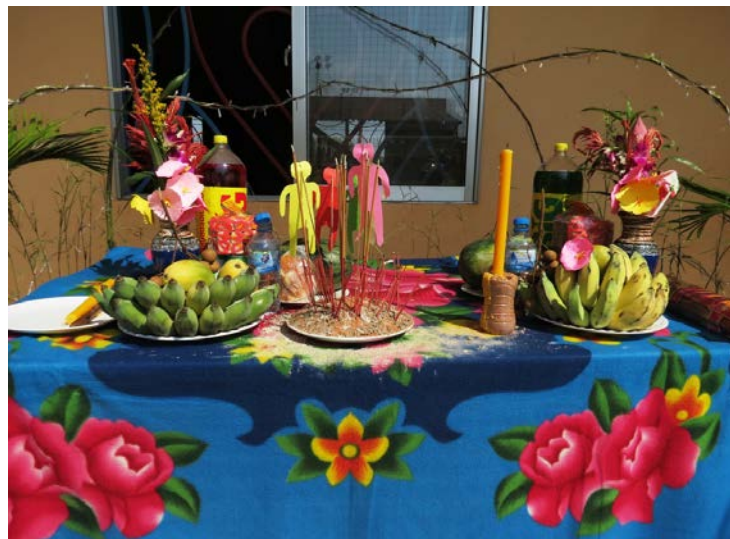
SUOSADAI KHMER CHNAM THAMAI – FELIZ ANYO NUEVO JEMER – HAPPY KHMER NEW YEAR