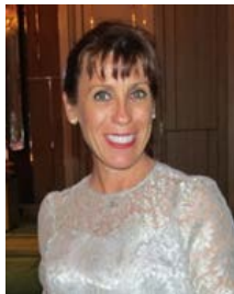
President & Founder

https://www.facebook.com/JuntosPorCamboya/